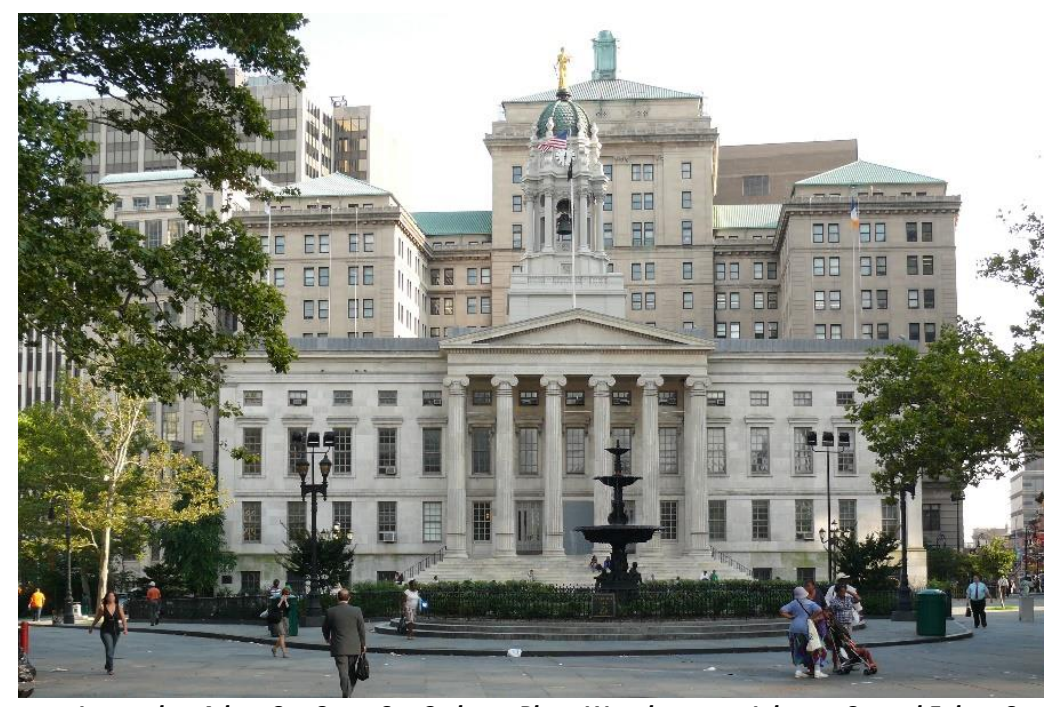
Located at Adam St., Court St., Cadman Plaza West between Johnson St. and Fulton St.