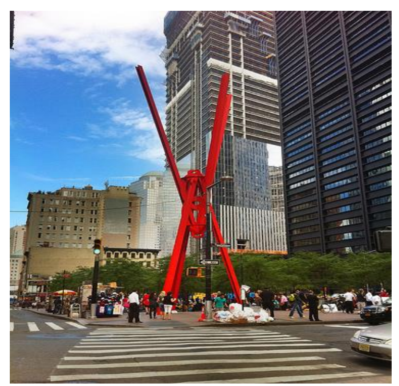
Located between Broadway, Trinity Place, Liberty Street and Cedar Street.

If the Bowling Green Street Park is not accessible, go to the Sculpture in Zuccotti Park.