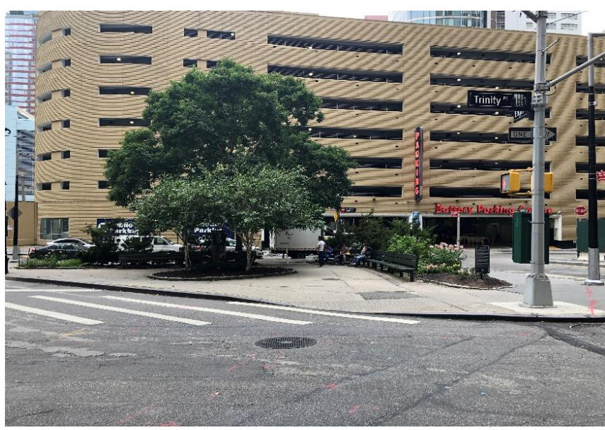
2 Edgar St, New York, NY 10006 (east of the parking garage)