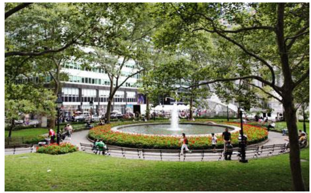
Broadway and Beaver Street – 500 feet from building

If the Bowling Green Street Park is not accessible, go to the Sculpture in Zuccotti Park.