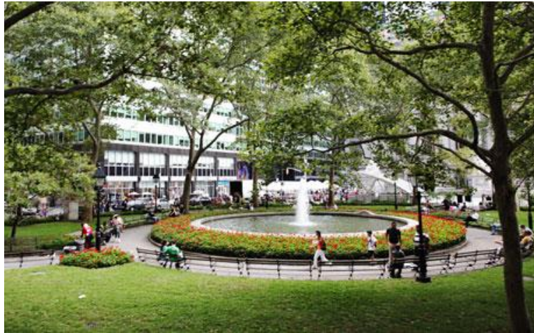
Broadway and Beaver Street – 500 feet from building

EVACUATION FROM 56 BROADWAY: go to the fountain at Bowling Green Street Park.