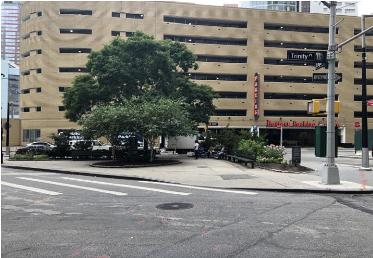
2 Edgar St, New York, NY 10006 (east of the parking garage)

EVACUATION FROM DEVOS HALL: go to Elizabeth Berger Plaza.