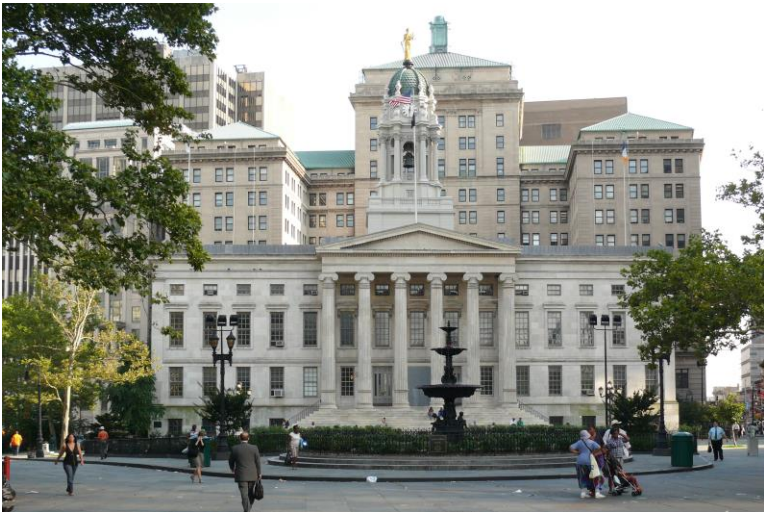
Located at Adam St., Court St., Cadman Plaza West between Johnson St. and Fulton St.

EVACUATION FROM CITY POINT: go to the fountain at Columbus Park.