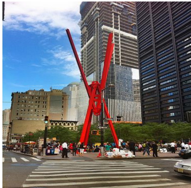
Located between Broadway, Trinity Place, Liberty Street and Cedar Street.

If the Bowling Green Street Park is not accessible, go to the Sculpture in Zuccotti Park.